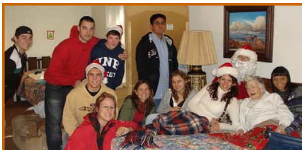
Clark FBLA members serving with joy in their hearts at Charleston Heights Assisted Living