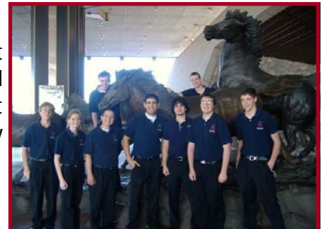
The 2007-2008 Nevada FBLA Officer Team outside the grand Sierra Resort during the Winter Summit.

To get started make sure to visit the state web site www.NevadaFBLA.org and download the officer candidate guide and candidate application. Follow the guidelines on the application packet and prepare for an amazing time at state, and if you are elected, an amazing 2008-2009 membership year.