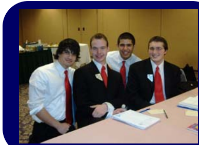
The team at breakfast