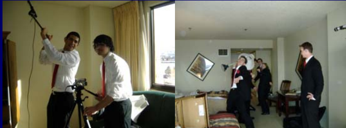
The entire team filming for the 2008 SBLC