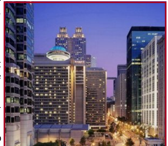
Hyatt Regency Atlanta: the host venue for the 2008 National Leadership Conference.

For a more detailed calendar be sure to check out the Calendar of Events on the state web site, www.nevadafbla.org !