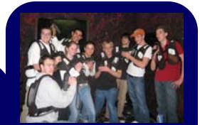
Team playing Laser Tag!!!