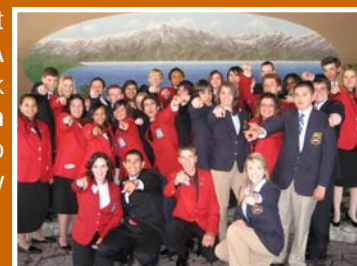
Nevada FBLA thanks you, the advisers!

Spring Creek, NV—FBLA would not be possible without the help of some great individuals: our advisers. Advisers do so much to make sure that our FBLA experience is as fantastic as possible. This is why we have a special day to thank our advisers for all of their hard work and determination. Adviser Appreciation Day was on Wednesday, February 13 this year. There is no better time to celebrate how much your advisers do for you than on this day. I would personally like to say thank you to all the advisers from the state officer team.